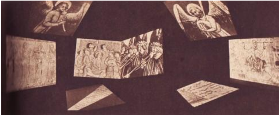
Image 1 - Polyekran, Award-winning Czech Expo 1958 in Brussels

Many computer games designs come still with a static mutual relations of the implemented objects, while offering free-move and interactions of the player’s avatars in 3-D environment. But the relational visual image design , having its roots already in Dadaism and Surrealism, and in media design tradition since 1958, for example Czech design principle of Polyekran and Prague’s Laterna Magica (V. Havel, 1999 or J. Svoboda, 1990) has not been explored in the interactive media context widely.